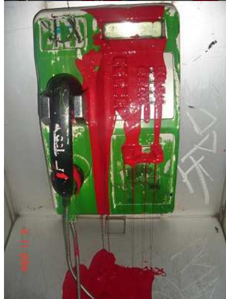
mexico city november 9, 2008 *