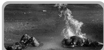
Bodies aflame after Israeli Bombing

When faced with the wholesale destruction of a people in such uncompromising terms as the recent mass destruction of south Lebanon by the Israeli military - a billion dollar war machine unleashing wave after wave of explosive & chemical attack on innocent civilians trapped by purposely destroyed roads & bridges where even the red cross get targeted - it is easy to feel helpless. What can we here at home do to stop or even oppose this?